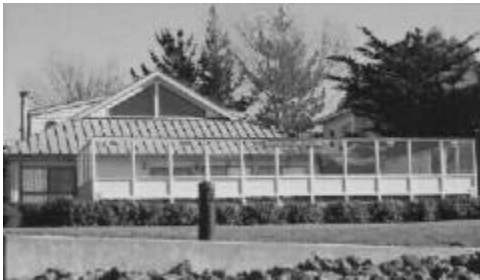
Marina Bay Yacht Club

Slipping through the Bay on a foggy November day