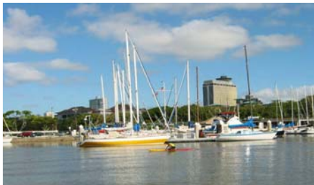
Nataraja at Waikiki YC

But, one must note, that yacht club affiliation doesn't get you anything. Our fee for the night was $1 per foot, ouch, which is what any Joe would pay. Of course, it does have a lot to offer---location, location, location. There are literally thousands of things to see and do within walking distance.