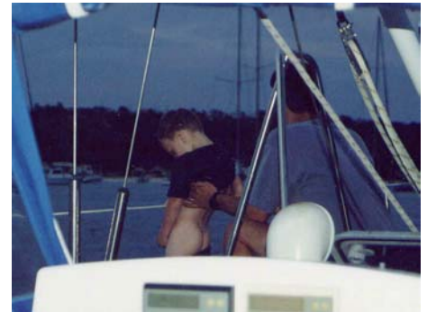
Hunt---not using the holding tank

Then back to the boat so the Erwins could fix the clogged head. You have a choice of fixing it yourself or having a repair boat from Oyster Pond chase you down and fix it for a stiff fee (if they decide it's your fault). It turned out to have been jammed by previous charterers. (As a side note, when we checked out our boat we asked where we could pump out the holding tank. The answer was that they don't use holding tanks in the Leewards.)