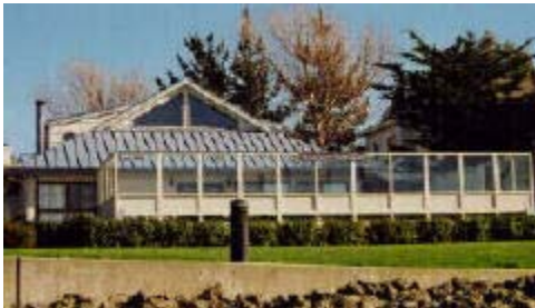
Marina Bay Yacht Club