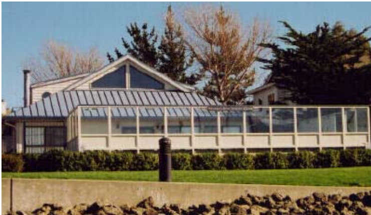
Marina Bay Yacht Club

P. O. Box 281, Sta. A Richmond, CA 94808