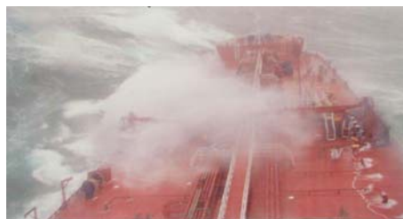
Cruisin' down Suisun Bay