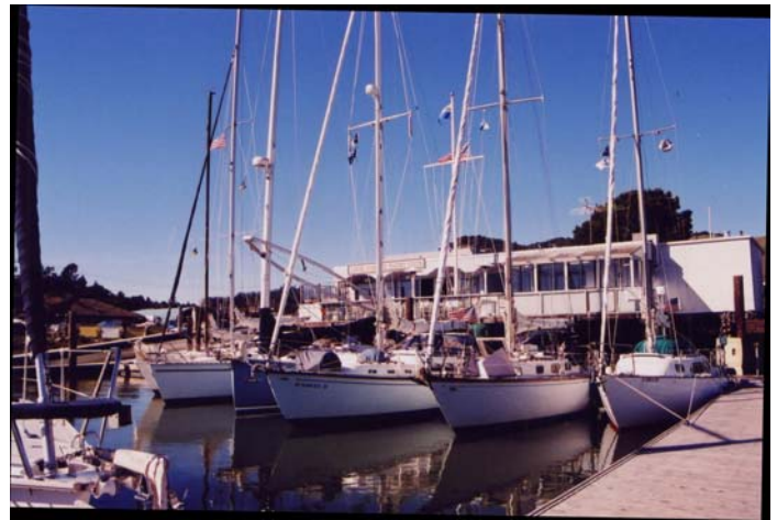
The raft at Loch Lomond in February

This is a good place to put in a plea for pictures of MBYC boats. We need them for the cover page of the Signal. We have newer members who have never had their pictures....or their boat's picture....in the paper. Help!