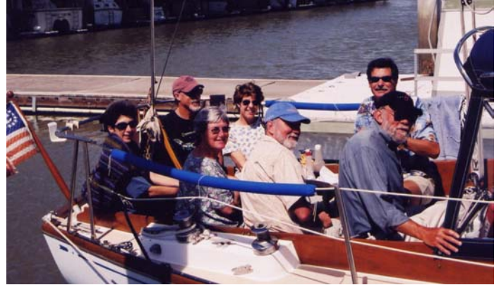
The cocktail hour (or so) at Pittsburg in May

Below are some pics stored in my camera for months. I finally used up the roll at Encinal. Do many of the characters look the same? Is Silverheels II the party boat du jour?