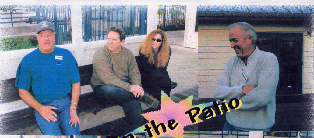
On the Patio