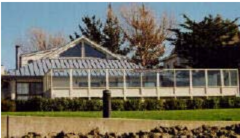
Marina Bay Yacht Club

P. O. Box 281, Sta. A Richmond, CA 94808