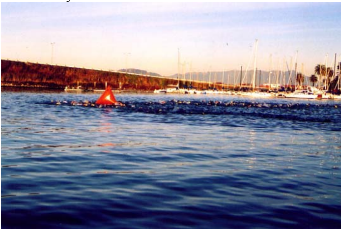
The Swim Race

Saturday morning came early. At 0610 I was awakened by loud voices. I wondered who was anchoring on top of us? When I looked out the hatch I found nothing close by. Then I heard it again. I looked over at Treasure Island and saw hundreds of people lining the shore! By 0710 there were 50 - 60 in the water swimming a course around buoy markers.