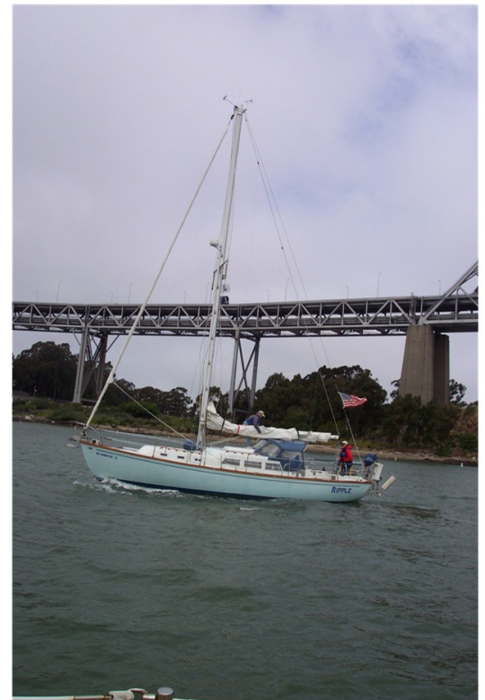
Ripple preparing to enter South Beach Harbor..... May 24, 2003

Let me know what you can do to help out!! MBYC needs your support