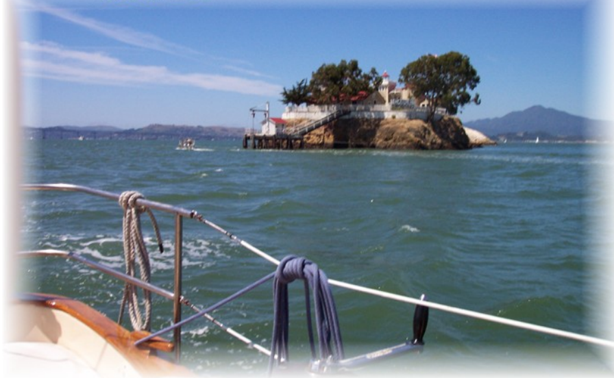
"The Brothers" ..... May 26, 2003

Last Minute Note: The June 21st Corsair event has been cancelled