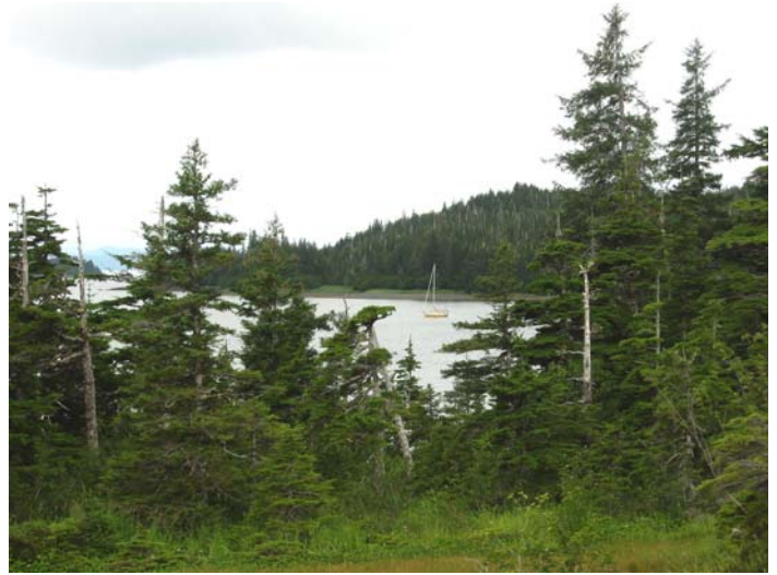
Cabin Bay, Naked Island, and Nataraja