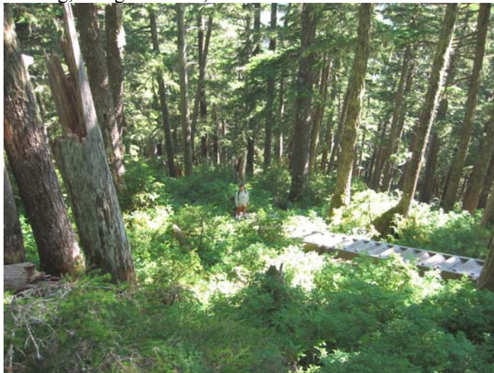
Emmy on the Gavan Hill Trail

Sitka boasts miles and miles of hiking and biking trails. Try as we might, we weren't able to do it all. But we covered quite a bit. One hike took us to the top of Gavan Hill ("gavan" is Russian for harbor), over three miles of uphill hiking, with more than a mile of it in steps. The trail began in the "muskeg" or bog, then wound through the spruce and hemlock forest, giving way finally to the alpine. The views from the top were absolutely stunning. Needless to say, our legs were rather sore the next day. The Starrigavan Recreation Area had a number of interpretative walks and trails that led through the muskeg, along estuaries, and into the forests.