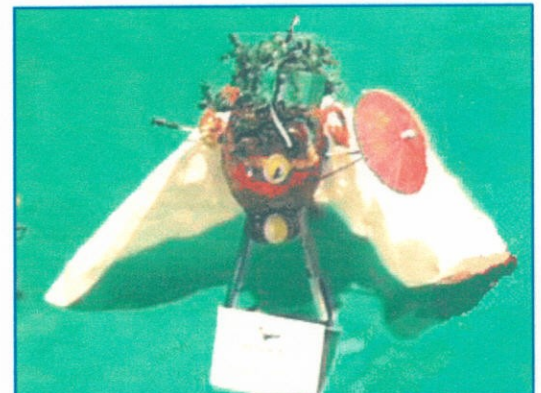
Here it is in all its glory, the Loch Lomond YC Potato Decorating Contest Grand Prize Winner. SAN FRANCISCO BRIDE

Loch Lomond YC served a traditional corned beef and cabbage dinner which was delicious, of course, but the highlight of the evening was the Potato Decorating Contest. First, we were divided into teams of four, then each team was given a raw Idaho potato and a small handful of items such as colored toothpicks, pipe cleaners and straws. Each team then had twenty minutes to decorate the potato using those items or anything else they could find at the table.