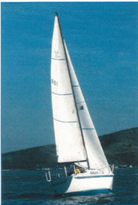
A rare photograph of the Maenad making headway free of San Pablo Bay's sticky bottom.