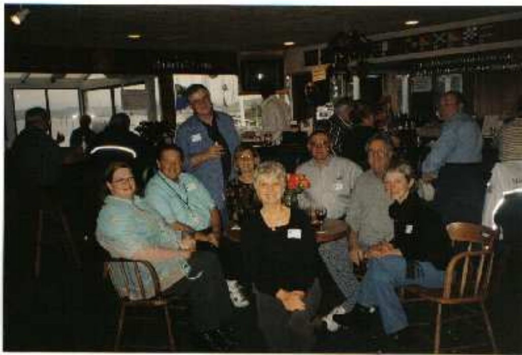
Marina Bay Yacht Club Members at Loch Lomond Yacht Club