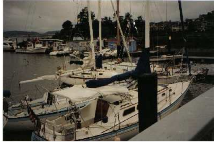
Marina Bay Yacht Club Fleet at Loch Lomond