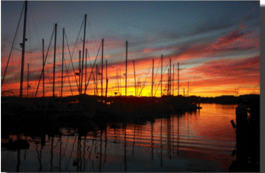
Sunset from Dakota