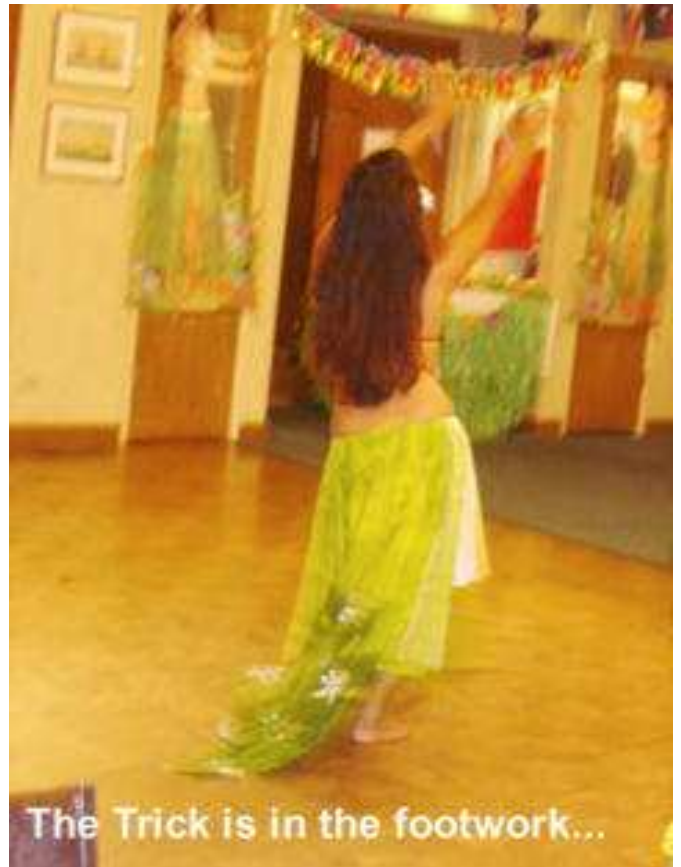
The Trick is in the footwork...