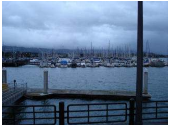
The Marina at Dusk