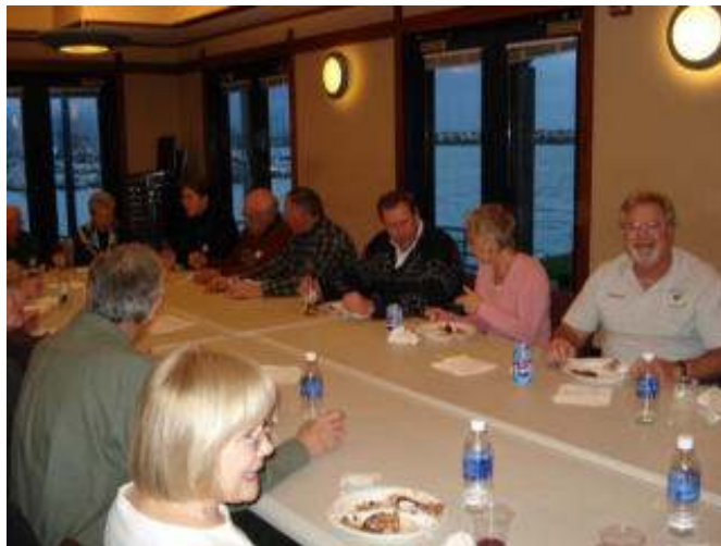
Dinner at the Harbormaster's