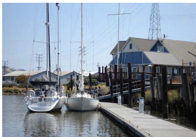
Grace and Windlock tied up in front of the Petaluma Yacht Club.

After we got tied up and secure at the Turning Basin, we took a short walk up to the Petaluma Yacht Club where they opened up their hearts and their bar, and then (surprise) we had a round of drinks on P.Y.C.'s back deck before walking over to Dempsey's for dinner.