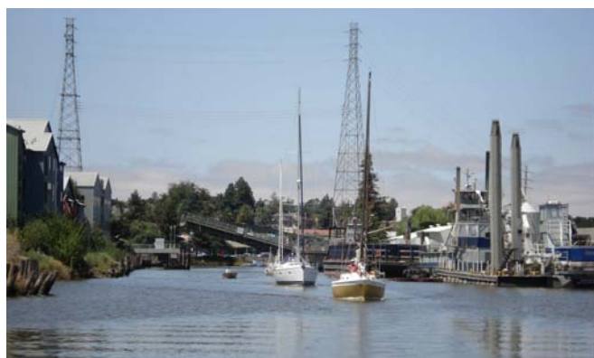
Heading home with the D Street Bridge in the background