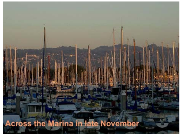
Across the Marina in late November