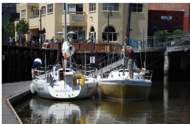
Pegasus and Uncle George with Downtown Petaluma in the background.

Petaluma is always one of our favorite destinations because the turning basin is in the center of town, surrounded by great places to walk, eat and sightsee. The trip up the river is always beautiful, and so long as you time your trip to the tides and watch your depth sounder, it can be very relaxing.