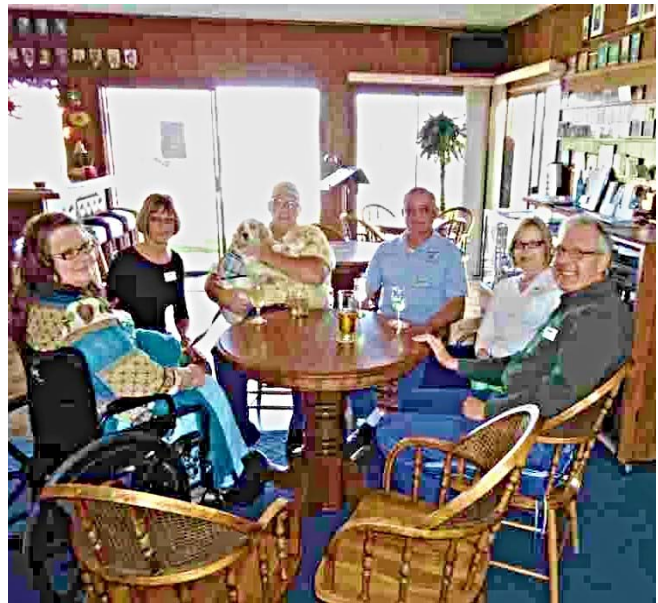
Good Friends, Good Times...

I received input from members regarding depth concerns in regard to the marinas entrance channel and depths within the marina itself. But later learned the channel and Marina were dredged in November 2009, to a minimum depth of 6 ft. at low tide.