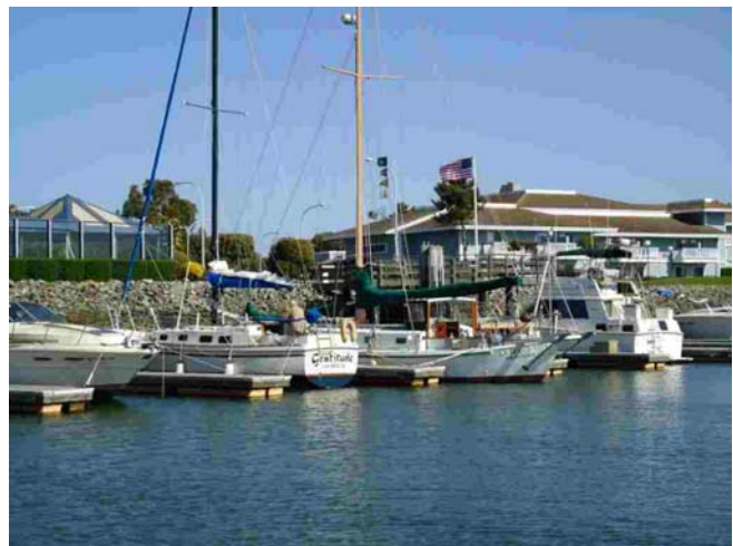
Gratitude and La Dolce Vita, hanging out...