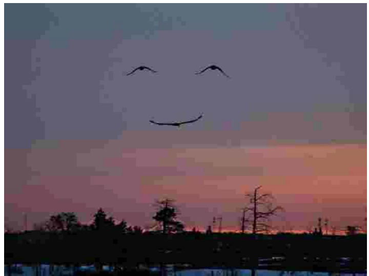
Someone has a good sense of humor...