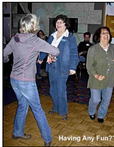
One can't tell which way they're going, but that's part of the fun...