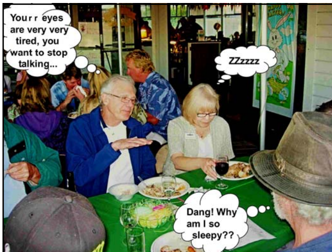
Everyone had a story to tell...

Another treat was visiting the adjacent docks where a wonderful collection of vintage wooden boats are slipped. I've walked around those docks at least a half dozen times and it never gets old.