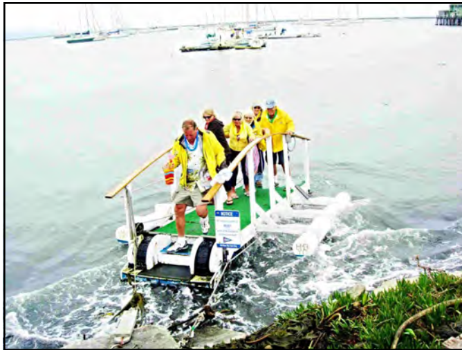
Interesting people watching, i.e. the first to jump off. If he falls in, it's back to the boat .