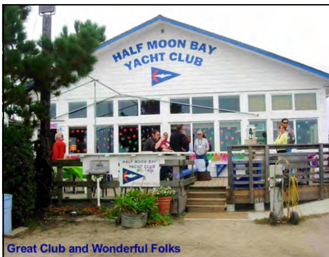
Great Club and Wonderful Folks