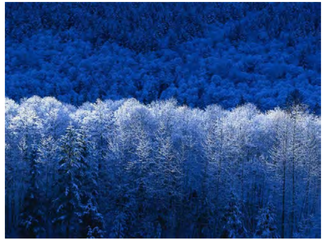
Winter's Coming, time to pick up the yard