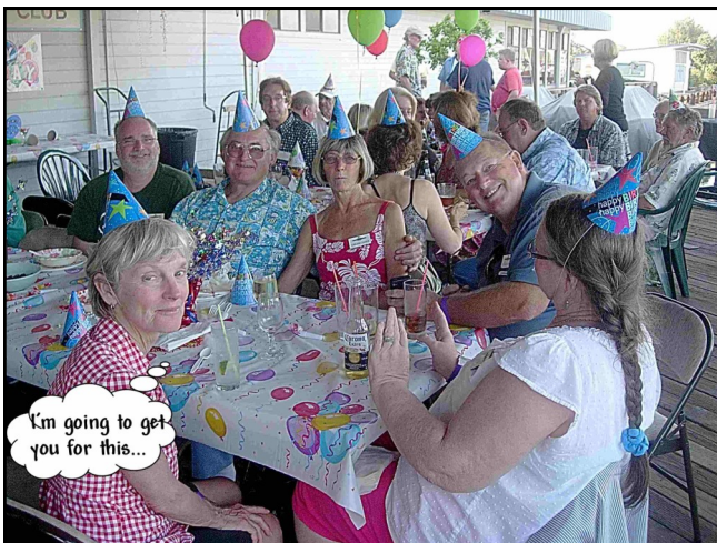
...and a good time was had by all.

They had a caterer who specializes in setting up Taco Bar's, and he had every imaginable ingredient to customize a taco for every taste. A great DJ was on scene to get the dancing going and that went well into the night.