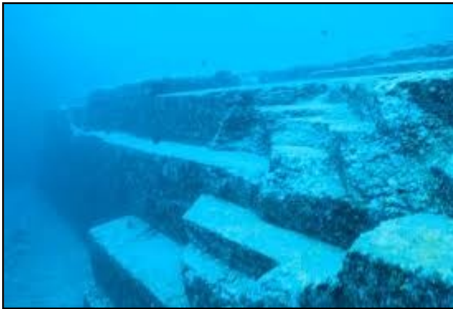
...we encountered huge square boulders

Once through the surf we encountered huge square boulders, nothing round like one might expect. Many were the size of two story houses. We marked these on our charts. We didn't see any vegetation until we were about forty feet deep. The offshore currents were very strong, too strong to swim against and every dive found us returning to shore along a different course.