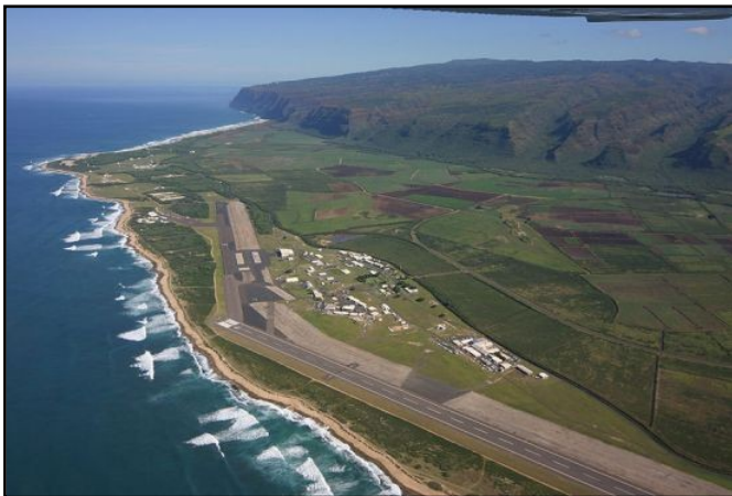
Barking Sands on the Southwest edge of Kauai

Our mission was to make a dozen dives from shore, out to about a sixty foot depth. We made our first dive just south of the Na Pali Coast and our last one about two miles west of Kekaha. We were looking for safe bottom conditions where a Bottom Lay System could be installed.