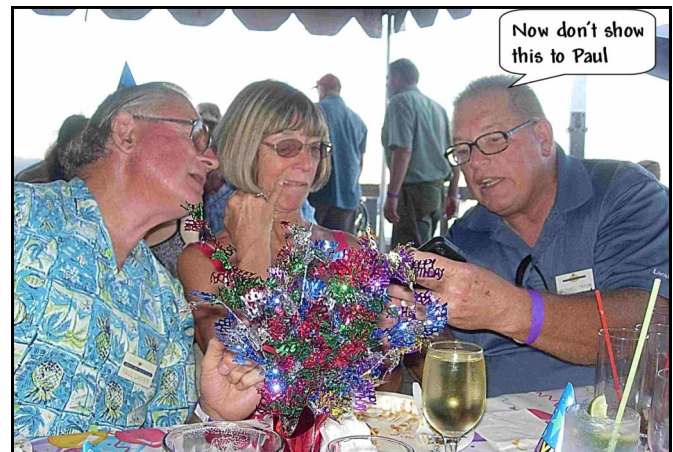
Serious discussions prevailed...