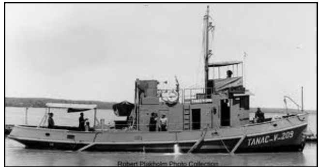
Navy Warping Tug

To install this system, Seabee's first dig a hole on the beach that's big enough to bury the framework for a large pneumatic pipe threading machine. Front end loaders, equipped with special hydraulic jaws then deliver 8 inch pipe, twenty-one feet long to the rack of the 'Threader.'