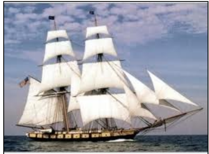
A two-masted square-rigged and the after mast fore-and-aft rigged. (Ok, now, try and say that fast)

In modern parlance, a brigantine is a principally fore-and-aft rig with a square rigged foremast, as opposed to a brig which is square rigged on both masts