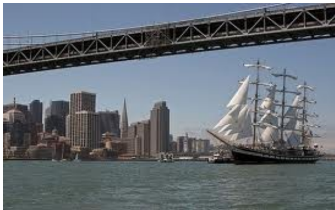
Russian tall ship Pallada sails past San Francisco's financial district