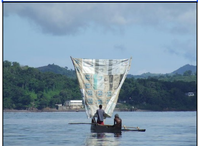
...Learning How To Sail