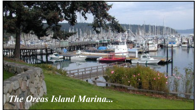
The Orcas Island Marina...

We motored into the harbor as a couple of sea-planes landed. With a lovely view of this charming port, we could see shops, restaurants, a hotel, church and condo development. On this stop we took a slip for a meal out and a hot shower.