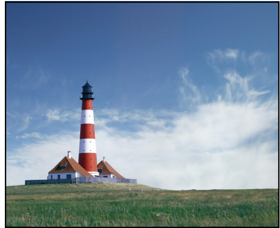
Remember the Radio Direction Finder?