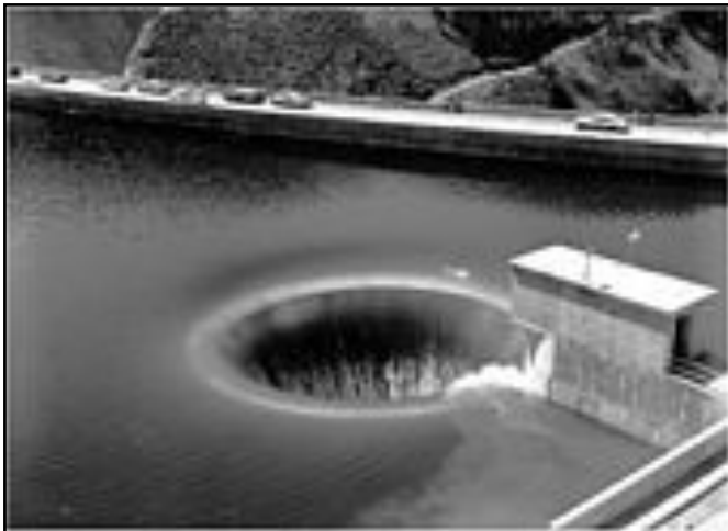
Overflow Inlet on a pond...

Michigan and early settlers built a dam there to form the Homer Mill Pond. The dam's spillway was undersized for this watershed and when it rained hard, excess storm water dropped into a large fifteen foot inlet, a dark vertical tube that dropped some forty feet, before turning at 90 degrees under the dam and continuing on for another twenty feet. This was four stories of twisting bubbles.