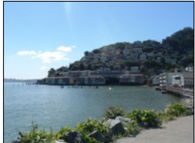
Hurricane Gulch: The Golden Gate just over the ridge

Other's who lived on abandoned boats and trains include Baby Face Nelson, Sterling Hayden, Jerry Garcia, Bill Cosby, Julie Christie, Otis Redding and Shel Silverstein, among others.