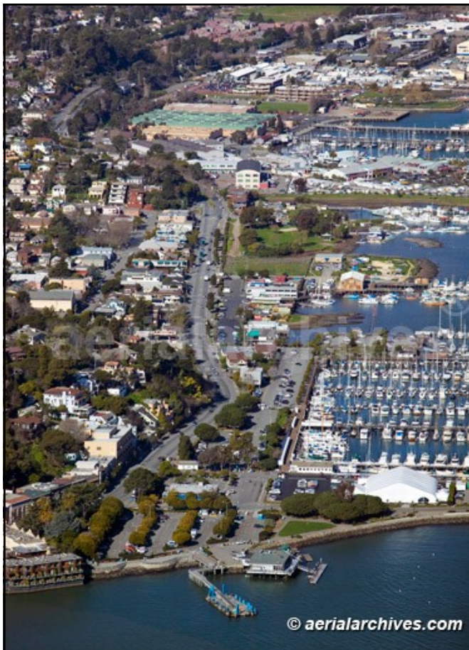
Sausalito's Busy Waterfront is, well, ...Busy!

Housing: Across the new highway and North of town, Bechtel built housing for their workers, . Marin City quickly grew from pasture to city with more residents than the Sausalito itself..