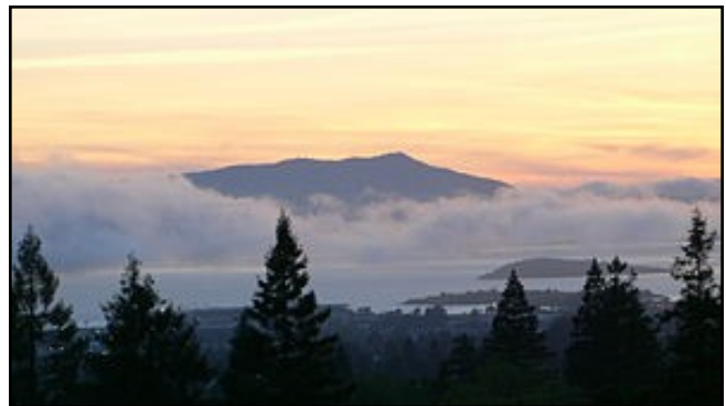
Mount Tamalpais at sundown.

Double Bow Knot: Billed as the "Crookedest Railroad in the world, the tracks at one point paralleled themselves five times in order to connect point A to point B, 130 feet higher and 800 feet away.