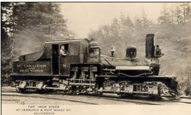
Shay No. 8 under steam amidst the Redwoods

During this time many laborers left the job to protest poor pay and expensive board: $1.75 a day for 10 hrs work and obligatory boarding house that cost them $5.25 a week. Hmmm