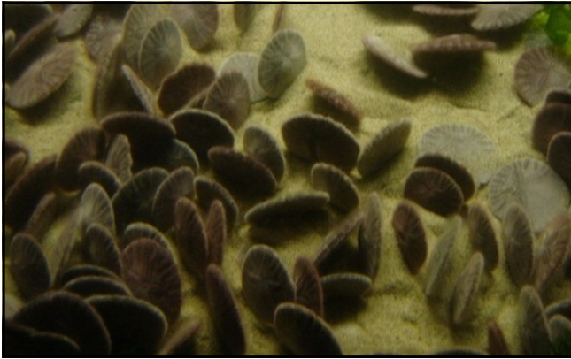
The shells were all laying on their edge, neatly positioned as if someone had spent hours placing them...

Unlike my story of the giant Moray Eel, that many read as a fable (oh so true), this time I had a witness. .