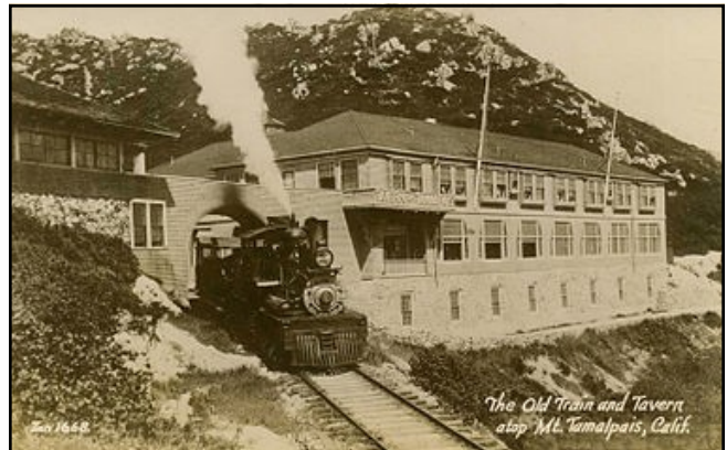
The Tamalpais Tavern was the northern terminus of the line. The structure provided a gathering place for railroad patrons, with a short walk to the peak.

Despite the labor problems, construction ensued. Within seven months, the railroad was complete to the top, at a cost of $5,000. The line had 3.2 miles of straight track, with the remainder composed of 265 curves. The last spike was driven on August 18, 1896, with the first passenger train operating just four days later.