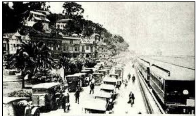
Bridgeway Avenue, on a Foggy Day

The Golden Gate: Before the bridge was built, folks heading north from San Francisco, took a car, train and passenger ferry to Sausalito, then traveled through town. When the bridge was completed in 1937, demand for the trains and ferries plummeted and in 1941, Sausalito reached the end of its role with the railroad and ferries. Without the trains and ferries, Sausalito was threatened with relative obscurity, ...until suddenly, World War II was upon us.