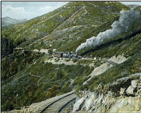
The geared, Shay steam locomotive works its way up the mountain. The trains are pushed up grade, with the engine reversed at the rear of the train.

The Task: Supplies and laborers arrived in Mill Valley to begin work and by February 1896, over 2,000 men, largely Chinese laborers, graded the route at 5-7% and laid the rails. Tracks were laid to the West Point Inn then on to the top, but not to the beach. ...Except for the roadbed, tracks down to Bolinas Beach (Stinsen) were never installed