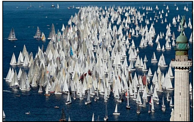
Free beer and wine on 'Grace,' ...Good Times until the wind picked up

bership and Board of Directors. The Secretary shall keep minutes of the aforesaid meetings and shall cause to be published in the official publication, a summary of the Board of Directors' meetings. The Secretary shall act as the official clerk for all elections. Should both the Commodore and Vice Commodore be absent, the Secretary shall act and perform the duties of Commodore. The Secretary is a voting member of the Board of Directors.