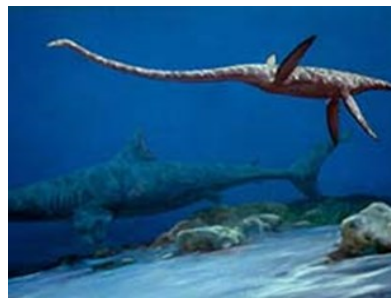
The Plesiosaur at play...

photos of the remains, the scientists were baffled. This creature was totally unknown and could not be classified.