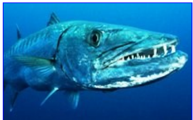
A friendly Barracuda

me suddenly disappeared. I taught my students if that should happen while diving on a reef or in a kelp bed, then watch out! There is always a good reason why everything went into hiding.