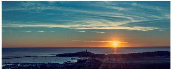
Pillar Point at the end of the day...

bership Meeting at Marina Bay on October 18. Please try and attend this important meeting.