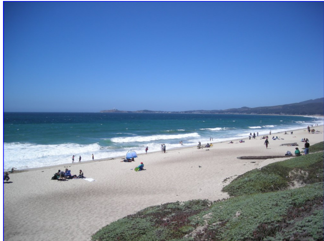
Plenty of beach for everyone...