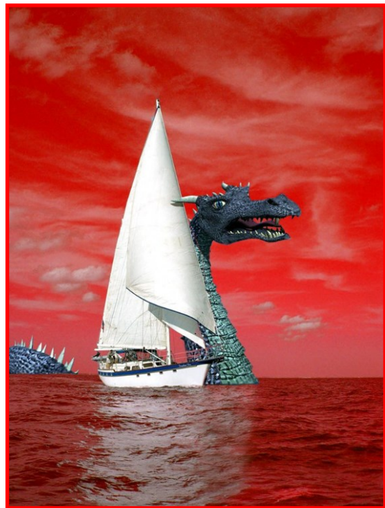
The say that sailing in China can be a challenge