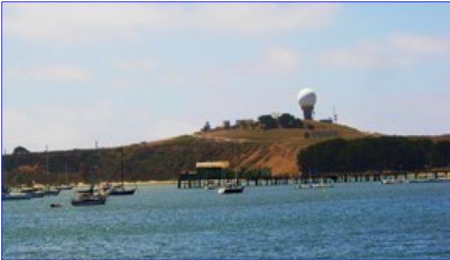
The popular Pillar Point golf ball...

The weather was outstanding and several yacht clubs from throughout the Bay Area attended, some by boat and some by land yacht.