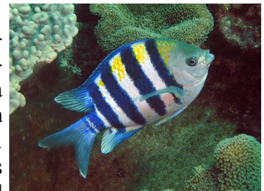
The Sergeant Major

While diving in Bermuda it is common to have 70 to 100 feet of visibility and you are never alone. Little fish called Sergeant Major, are pretty white fish with wide blue vertical stripes and splotchy yellow along the dorsal fin. They love to bite the tiniest hairs off your body. They're more of a nuisance than painful and one simply swats at them like a mosquito and they'll leave you alone for a few seconds. For some reason, they are rarely seen around the famous pink sand beaches.