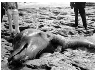
Washed up on Moore's Beach in Monterey Bay, CA in 1925

When the captain returned to shore, he developed the pictures and brought the findings to marine scientists. After they scoured over the information