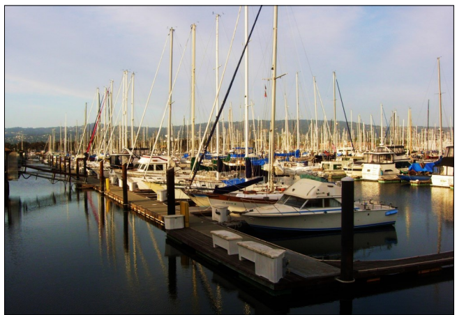
Alameda Yacht Harbor, at the end of the day...